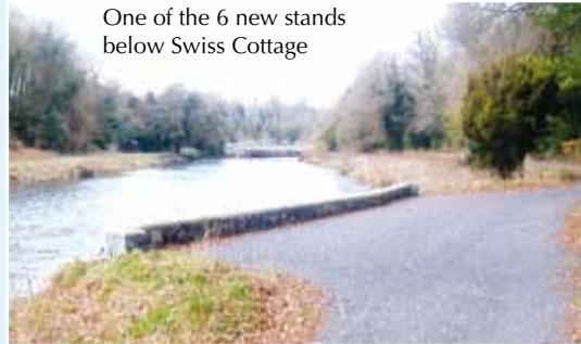
One of the 6 new stands below Swiss Cottage