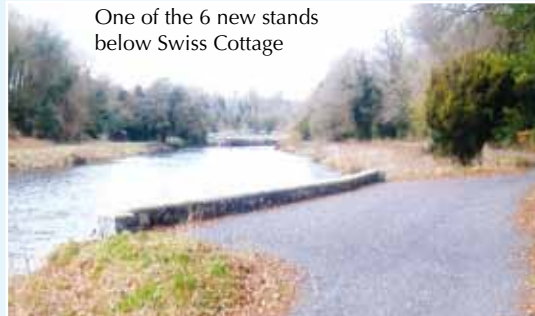
One of the 6 new stands below Swiss Cottage

Brown trout: (fly fishing only). Salmon: A state licence is required and catch & release. Permits are available from the Heritage Shop in the Square, tel: 052 74 42730, they can be obtained from 7am to 11pm seven days. Permits are also available for day and weekly rates and must be carried with anglers at all times. Anglers are asked to cooperate fully with bailiffs and water keepers. The angling season for trout and salmon within the Suir catchment area begins March 17th and ends September 30th. To fish for salmon it is necessary to obtain an angling licence. These can be obtained locally or online at www.salmonlicences.ie