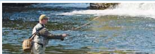
Fishing on the Weir In Cahir.