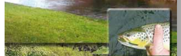
A Brown Trout River of Excellence