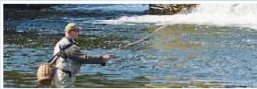
Fishing on the Weir In Cahir.