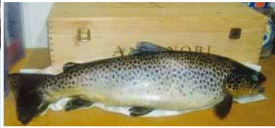
A beautiful wild brown trout of 5.05 caught below Cahir at Ballyhern stretch in August on a dry sedge.