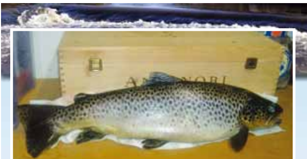
A beautiful wild brown trout of 5.05 caught below Cahir at Ballyhern stretch in August on a dry sedge.